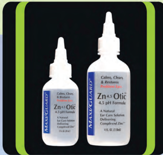
MAXI/GUARD® Zn 4.5 Otic® 2 oz. and 4 oz.