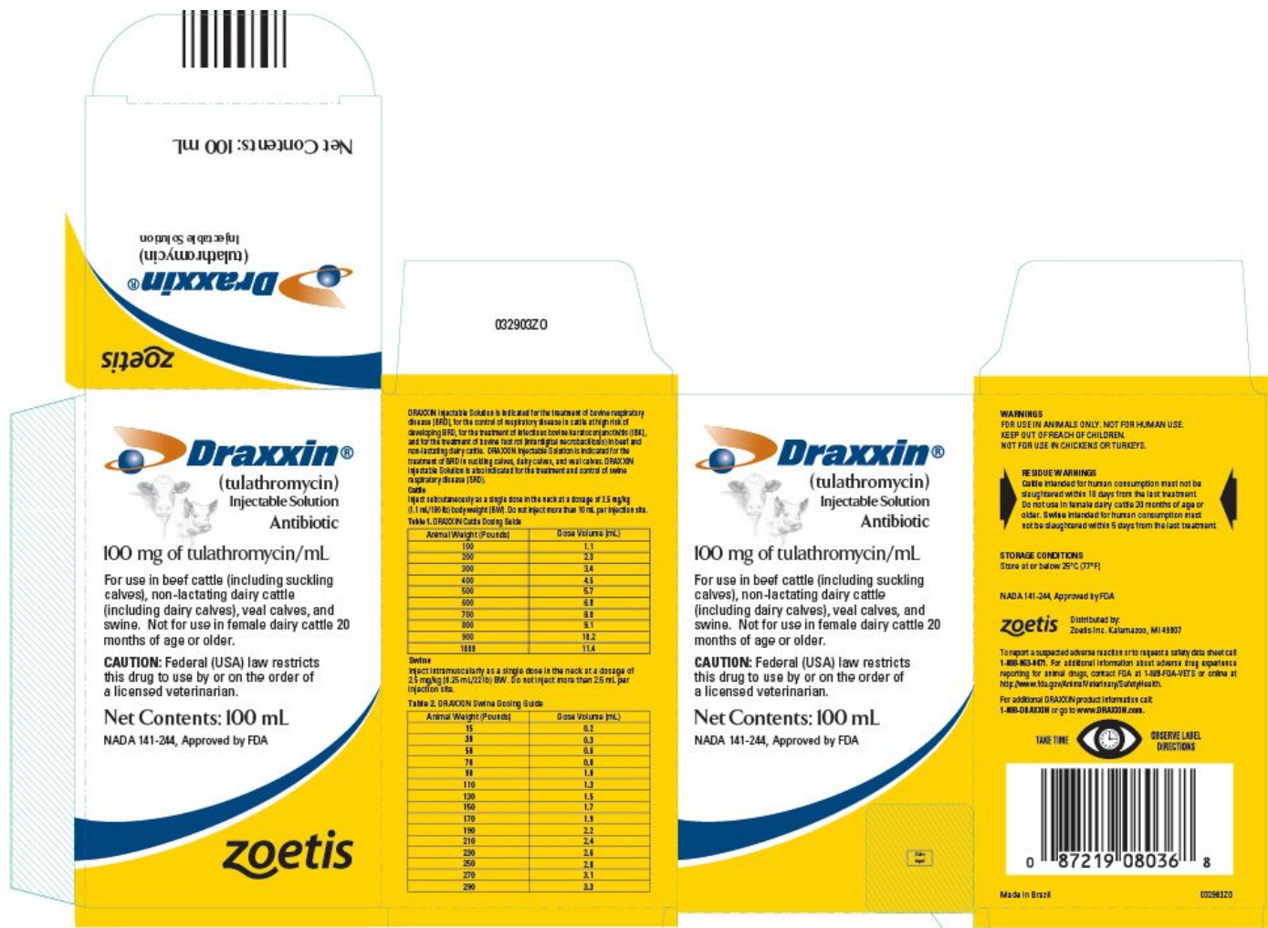
100 mL Carton Label Draxxin made in Brazil