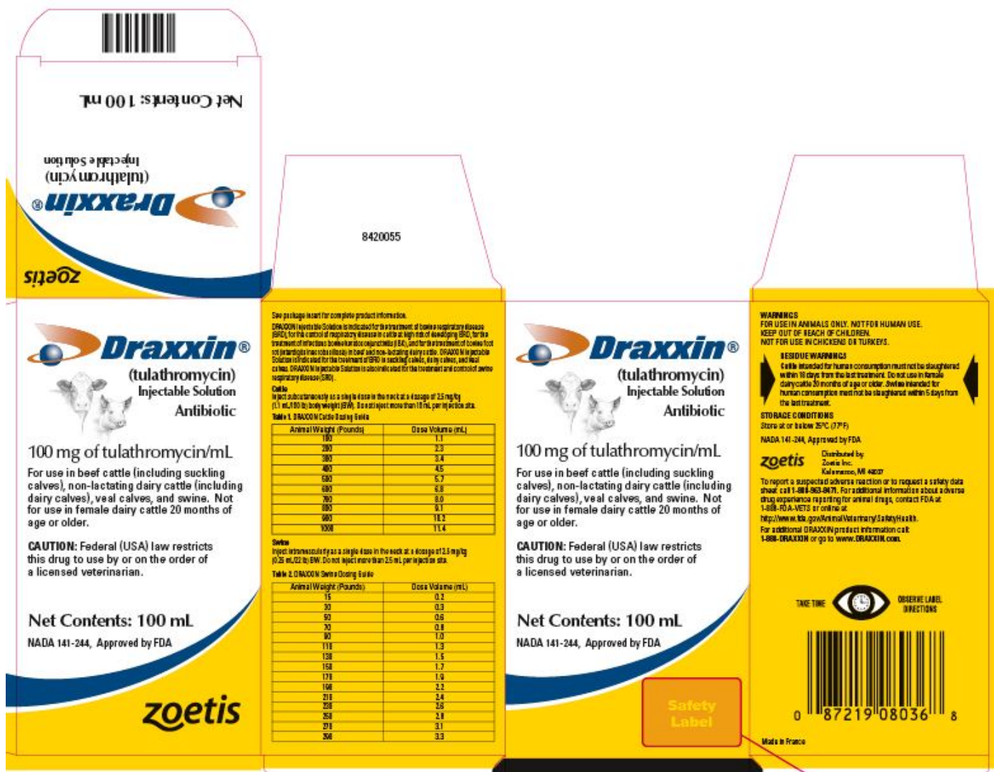
100 mL carton Label Draxxin Made in France