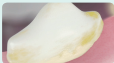
Plaque builds up, hardens into tartar