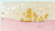
Bacteria attach and accumulate on tooth enamel